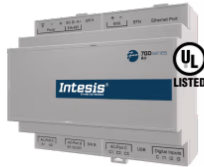
Daikin to Modbus TCP/RTU - Up to 4 Indoor Units

The Daikin application has been specially designed to allow bidirectional control and monitoring of Daikin HVAC (DIII-NET) from a BMS, SCADA, PLC, or any other device working as a Modbus client. The solution allows the integration of up to 4 indoor units from a single interface.