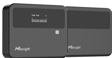
Master Device Node Device

With easy configuration and wireless detection, the VS360 facilitates simple deployment and connectivity. Compliant with the Milesight LoRaWAN® gateway and Milesight Development Platform, users can know the number of passage people and trigger other sensors or appliances easily.