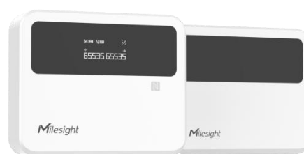
Master Device Node Device