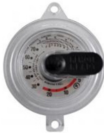
R3D LP Dial Sr. Tab

The ALTA Propane Level Monitor supports both Jr. and Sr. R3D Gauges. Monnit's level monitor does not support anything outside of this specification.