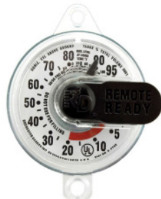
R3D LP Dial Jr. Tab